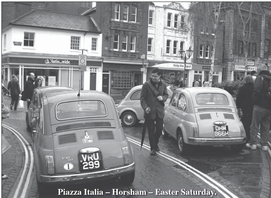
Piazza Italia – Horsham – Easter Saturday.

Looking back over the past year, I realised that we have attended a few events that haven't had a write up in the magazine. So here goes with a few memories: