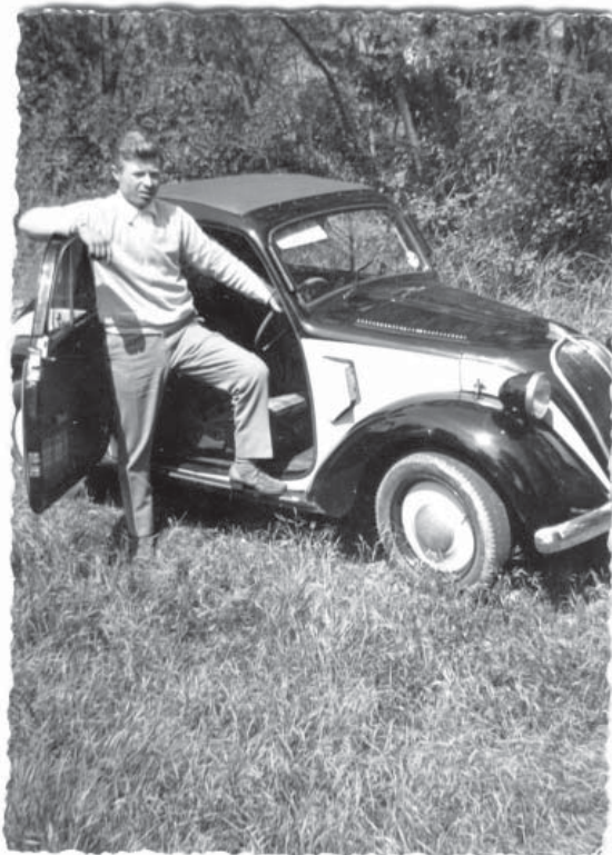
With my Topolino

Before the year was over, Fiat had brought out a revised model.