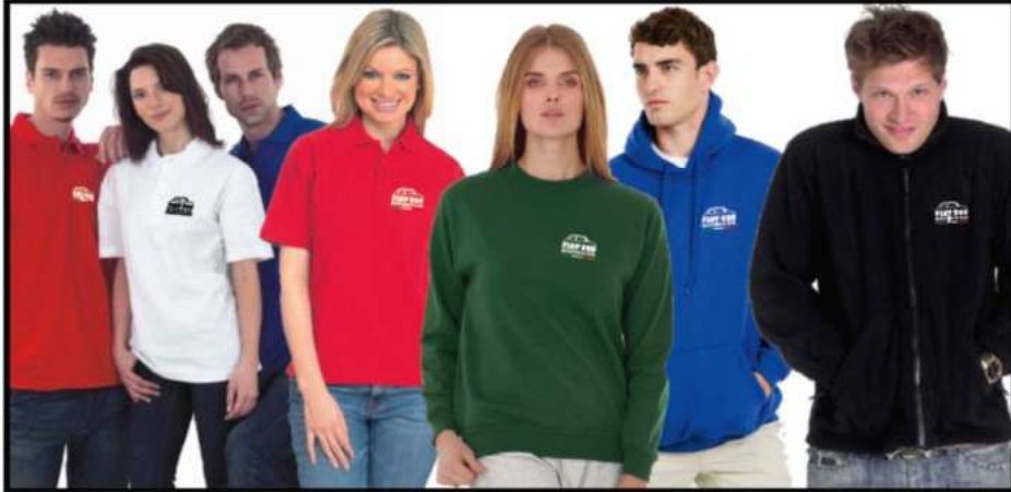
Male &amp; Female options available

Colours available Colours may vary slightly because of print or screen variants.