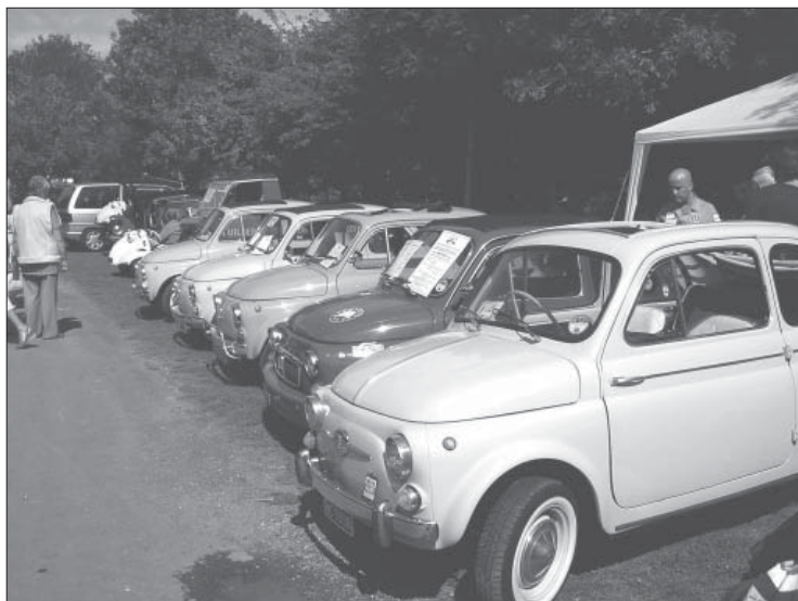
The usual line up of cars, all different colours, (although as this picture is in black and white you can't appreciate this!!)