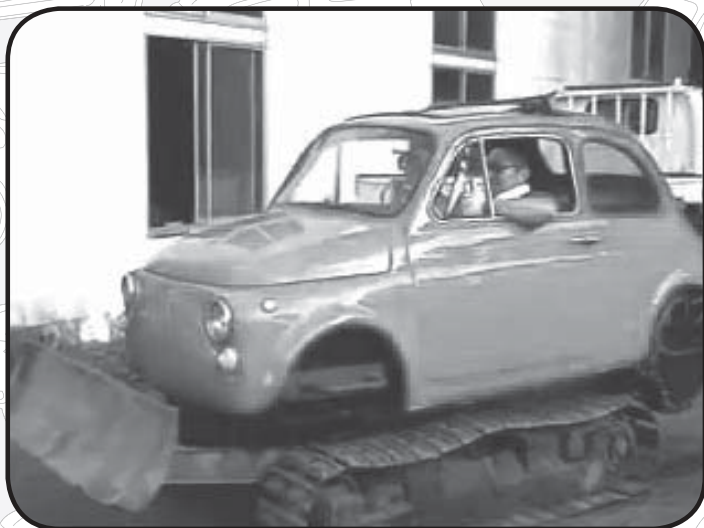
Fiat 500 Bulldozer.