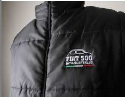
Black Lightweight Bodywarmer £30.00