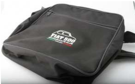
Graphite Retro Flight Bag £10.00