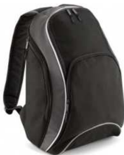
Graphite Backpack with Club Logo £25.00

See our full range online at: http://fiat500enthusiasts.co.uk/shop