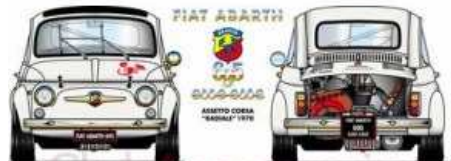
Classic Poster Fiat 500 'Abarth' 50x70cm