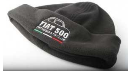
Black Fleece Hat with Club Logo