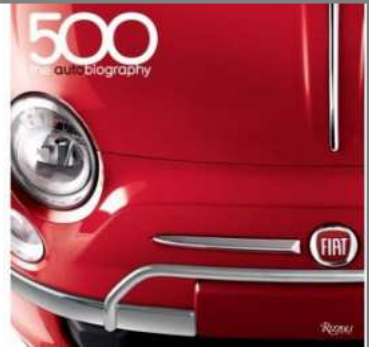
Fiat 500: The Autobiography £27.00