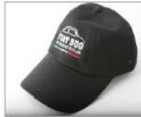
Black Baseball Cap Baseball cap with the club logo in contrast stitching. £12.50