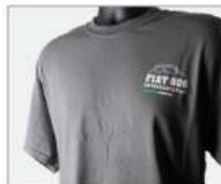
T-Shirts A good quality T-shirt with printed club logo. Available in Grey or Black. £9.00