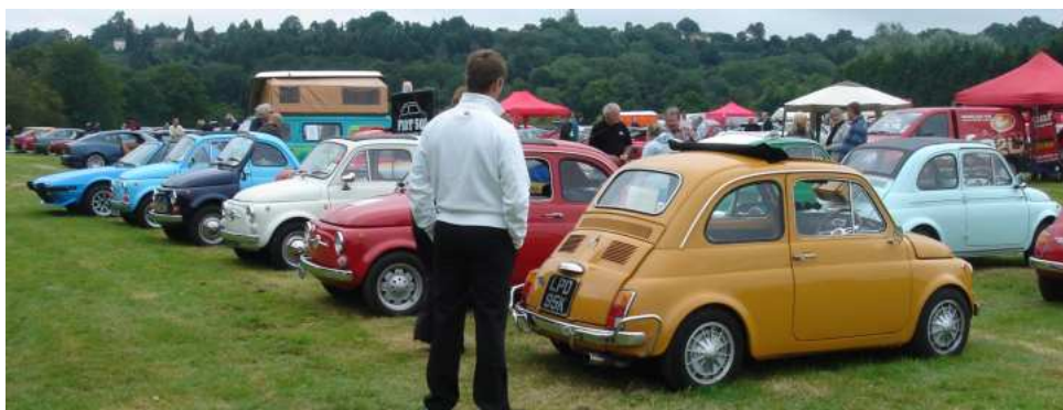
A really good turnout at last year's show at Honnington Farm

Please contact Nathaniel Cross at web@fiat500enthusiasts.co.uk