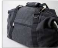
Weekend Holdall Vintage canvas bag (vintage black or navy) featuring the club logo. £35.00