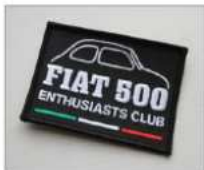
Iron-on Badge Customise your own clothes with our iron-on badge. £3.00