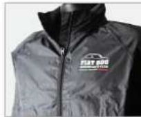
Lightweight Rain Jacket Breathable mesh lined waterproof jacket £15.00