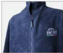
Active Fleece Jacket Navy blue heavyweight fleece with club logo £25.00