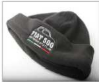
Black Fleece Hat Fleece hat with the club logo in contrast stitching. £11.50