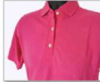
Womens Polo Shirts A good quality heavy-pique 100% cotton polo shirt with contrast embroidered club logo. Available in Fuchsia and Cornflower Blue. £17.50