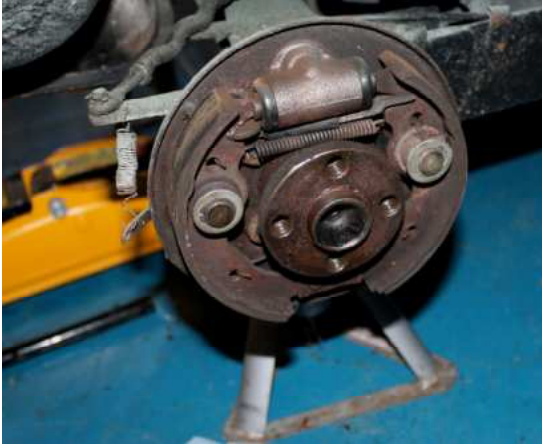
Rusty old pads and wobbly bearings!!

here, every job leads to another, leads to another...and onward.)