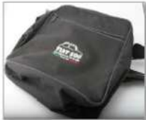
Graphite Retro Flight Bag Useful flight bag with embroidered club logo. £10.00