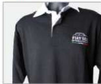
Black Rugby Shirt A good quality Rugby shirt with contrast embroidered club logo. £30.00