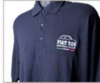
Navy Mens Polo Shirt A good quality heavy-pique 100% cotton polo shirt with contrast embroidered club logo. £17.50