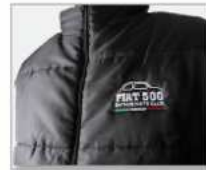
Black Bodywarmer A lightweight gilet with contrast embroidered club logo. £30.00