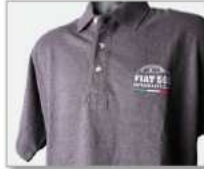
Charcoal Mens Polo Shirt Classic mens polo with embroidered club logo. (special offer) £15.00