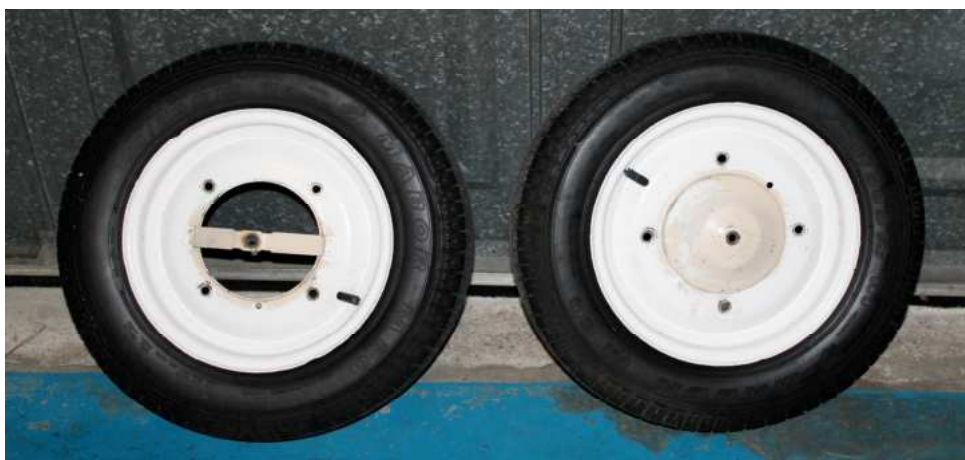
500F wheel next to a 500D

While I was playing with the brakes, I felt that the bearings were more than a bit wobbly. I really wasn't happy with them, so guess what I needed? Yes, you