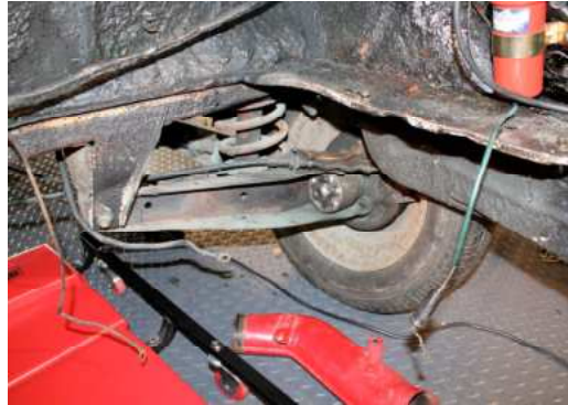
The old flexible joint on the stub axle

before the nut went on. Now I could get tension on the pre-load! A four foot crash bar on my socket set and I could get plenty of leverage. Blow the 1lb weight hanging 4.3 inches from the centre. The Haynes manual for the 126 has a different method! I found an old fishing spring balance and a 1lb pull weight on a cord wrapped round the brake drum worked!