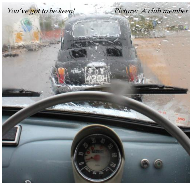
You've got to be keen!