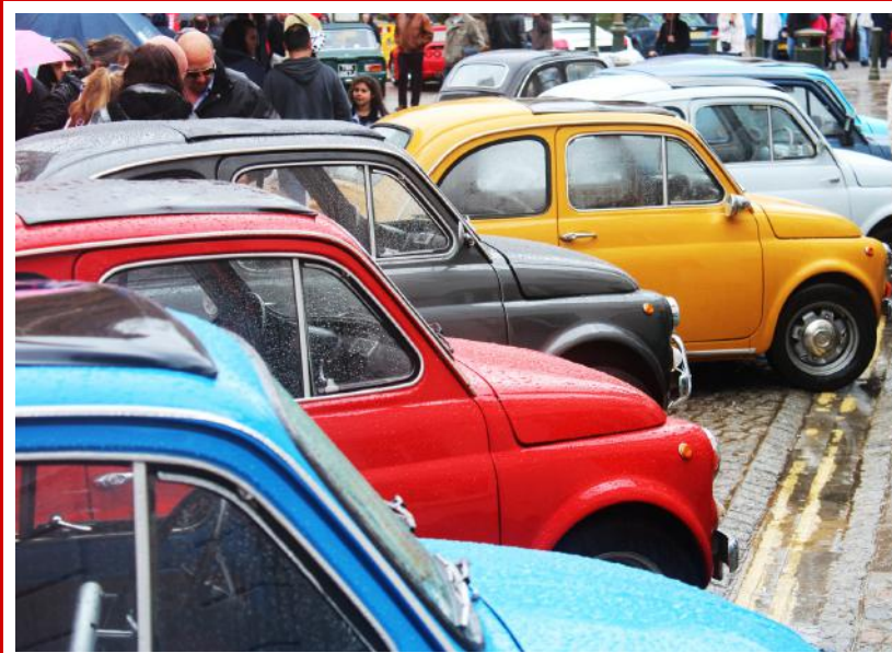
Horsham Piazza Italia