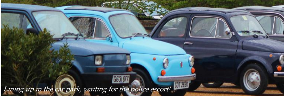
Lining up in the car park, waiting for the police escort!